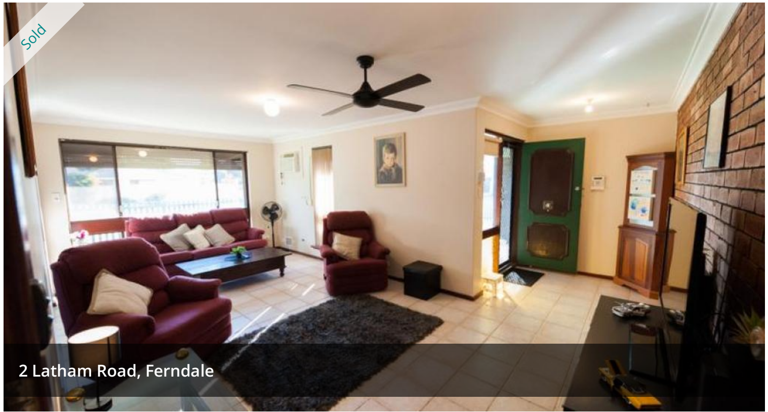
2 Latham Road, Ferndale