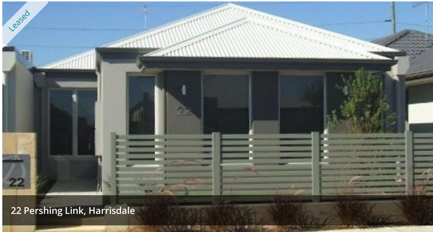
22 Pershing Link, Harrisdale