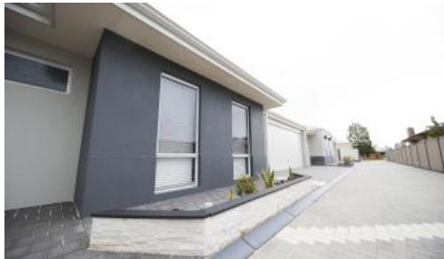
Unit 4, 37 Morley St, Maddington