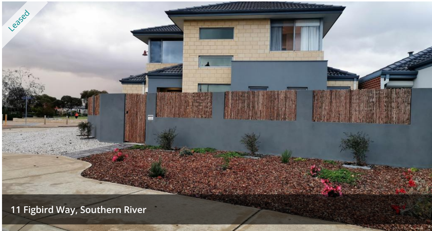
11 Figbird Way, Southern River