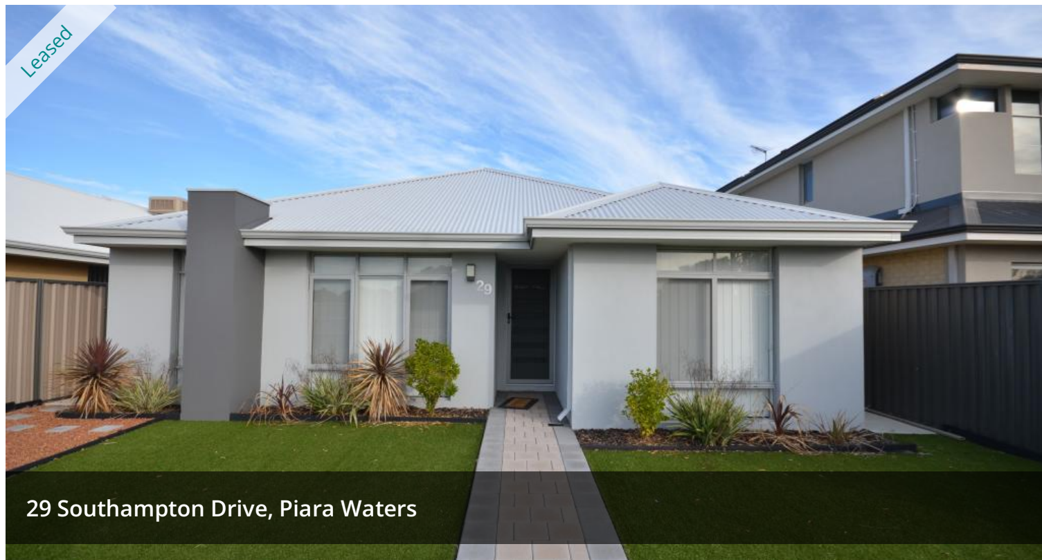
29 Southampton Drive, Piara Waters