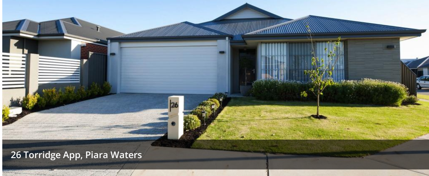
26 Torridge App, Piara Waters