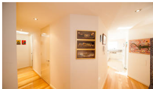
Unit 24, 88 Great Eastern Hwy, Belmont