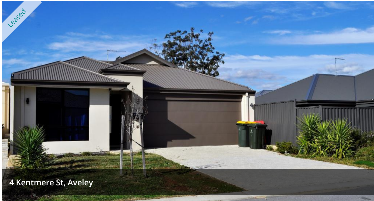
4 Kentmere St, Aveley